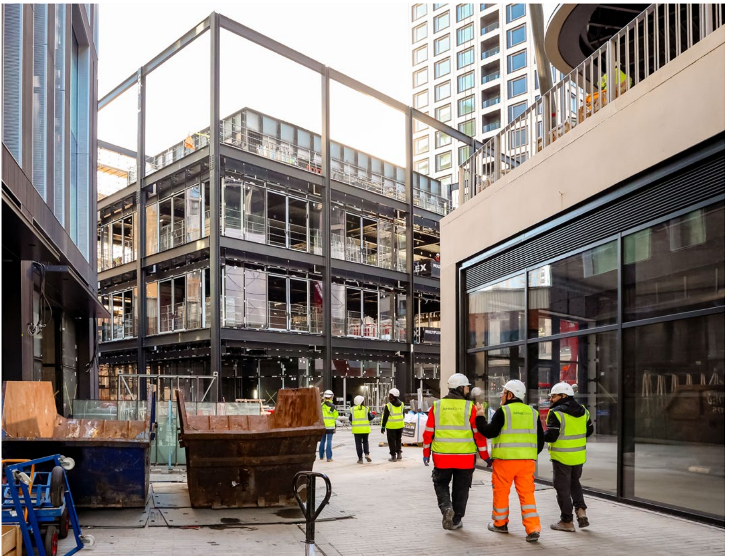
The dedicated retail, leisure and workspace 'podium' structure is nearing completion

December saw continued progress across The Elephant, with the London College of Communication campus entering its final stages of fit-out, residential inspections largely complete across all towers, and public realm works advancing around the site. As construction activity continues into the new year, this update also highlights community investment through the return of the Inspiring Elephant Community Fund, alongside local wellbeing and skills initiatives taking place in the Community Hub.