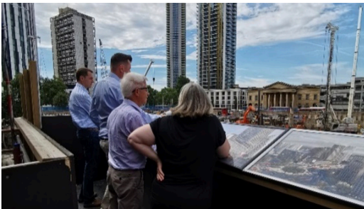
MPX-LSBU Visit 12.09.2022

The project was audited by the Considerate Constructors Scheme on 20th September 2022. The project scored a fully compliant score (45/45).