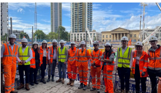
FPS Early Careers Group Visit 06.09.2022